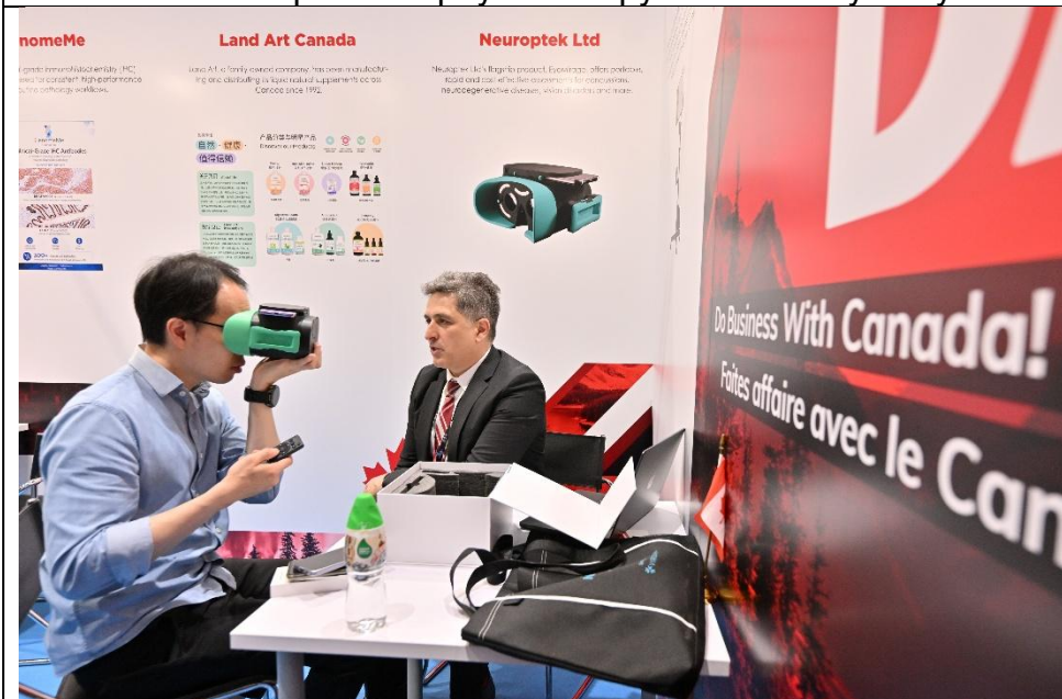
Exhibitor from Canada bring medical technologies, highlighting clinical applications and solutions.