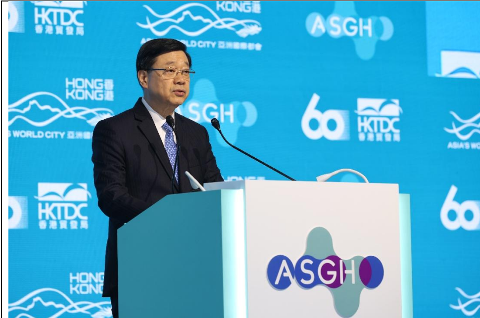
John Lee , Chief Executive of the HKSAR, delivered the opening remarks.