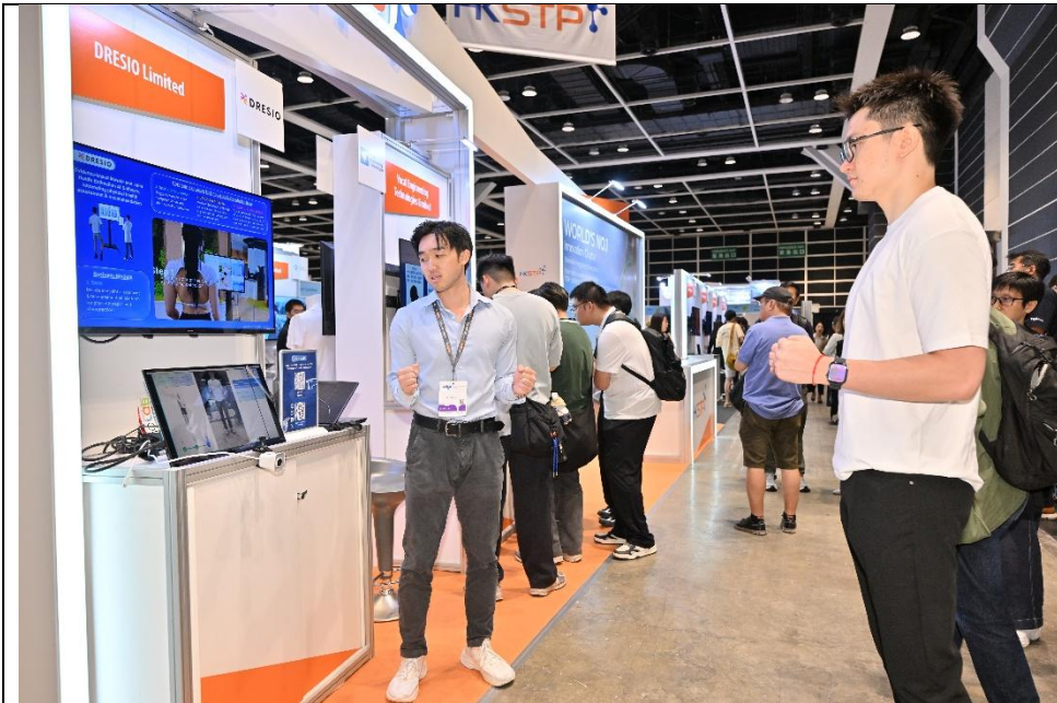
Led by the Hong Kong Science and Technology Parks Corporation (HKSTP), DRESIO Limited showcases its AI-powered physiotherapy motion analysis system.