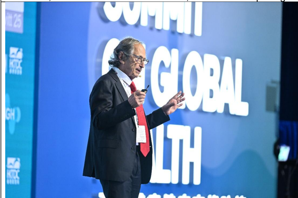
Prof Michael Levitt , 2013 Nobel Laureate in Chemistry, and the Robert W and Vivian K Cahill Professor in Cancer Research at Stanford University, shared his insight.