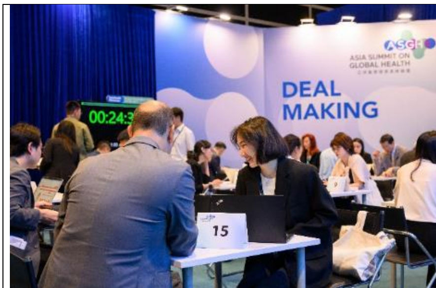
ASGH Deal-making facilitated over 390 one-on-one meetings