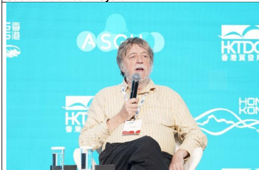
Prof John Hardy , Chair of Molecular Biology of Neurological Disease at UCL Queen Square Institute of Neurology. As an internationally renowned neurogeneticist, Prof John Hardy has been awarded the Brain Prize for "groundbreaking research on the basis of Alzheimer's disease" and is known as the "father of Alzheimer's disease genetic studies". He shared his latest research findings and advanced developments during the Dialogue with Global Pioneer in Health session