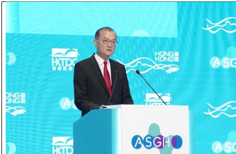
Prof Lo Chung-mau , Secretary for Health of the HKSAR Government, delivered a keynote speech on the first day during the Plenary Session I: Shaping a More Equitable and Sustainable Health System