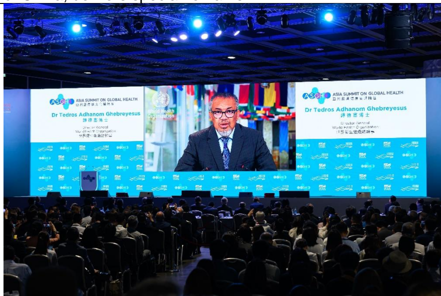
Dr Tedros Adhanom Ghebreyesus , Director-General of the World Health Organisation, delivers remarks at the opening session via video link