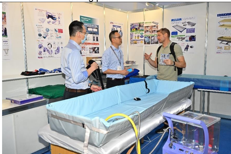
This year's Medical Fair features eight key product zones, including Biotechnology , Hospital Equipment and Rehabilitation and Elderly Care .