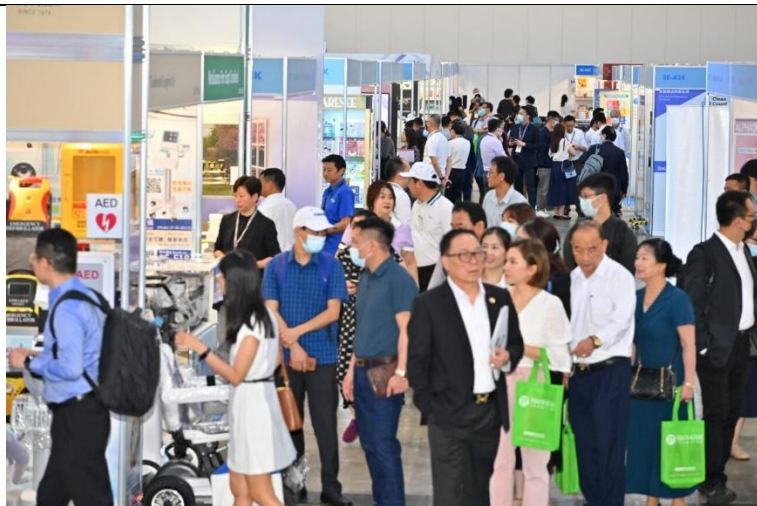
The Medical Fair attracts global buyers seeking the latest advances in medical equipment, technological solutions and healthcare products.