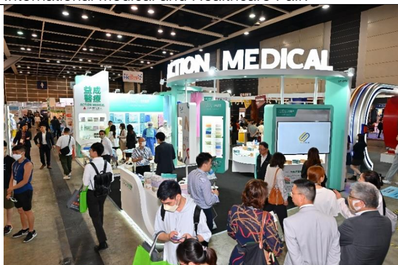
With the support of the HKMHDIA, 20 companies exhibit the latest medical imaging equipment and health monitoring products.