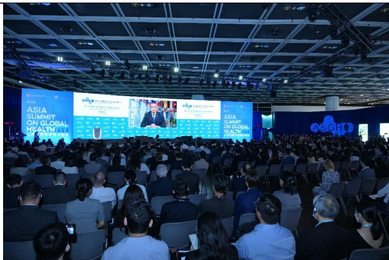
The Asia Summit on Global Health was held successfully last year.